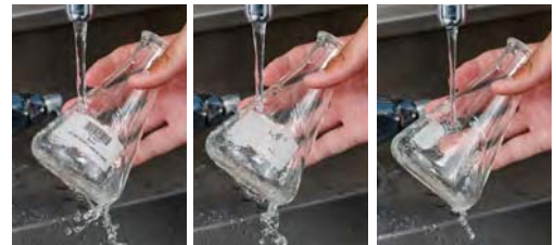
Dissolves in 30 seconds with no residue.