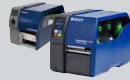
NEW BradyPrinter i7100 and legacy PR PLUS printer