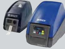
NEW BradyPrinter i5100 and legacy IP™ Printer

The following pages contain 3" core label rolls that are designed for use in these printers unless otherwise noted.